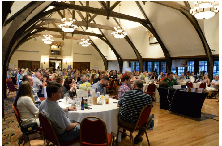
The TCNEF Annual Meeting evening dinner and awards ceremony underway.