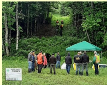
Workshop underway in Stowe, VT on June 1.

the Northeast routinely face challenges associated with streams and wetlands when conducting timber harvests and have great expertise when it comes to logging without impacting water quality on the job site and in waters downstream. Building and maintaining stream crossings that minimize runoff are an important part of that, and the workshops are an opportunity not only for loggers to refresh their skills, but to share their own experiences and ideas with the greater logging community.